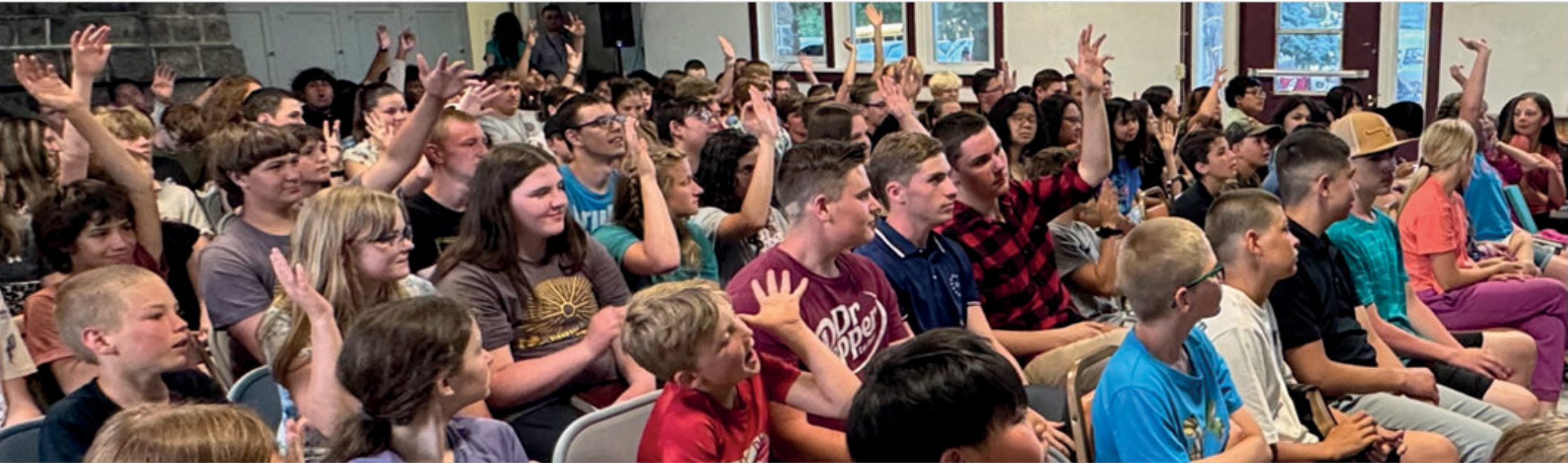
RICHMOND LAKE BIBLE CAMP...the next best place to be!